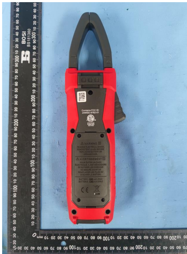
Photo 2 - Rear view