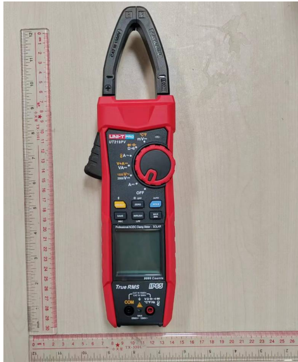
Photo 1 - Front view